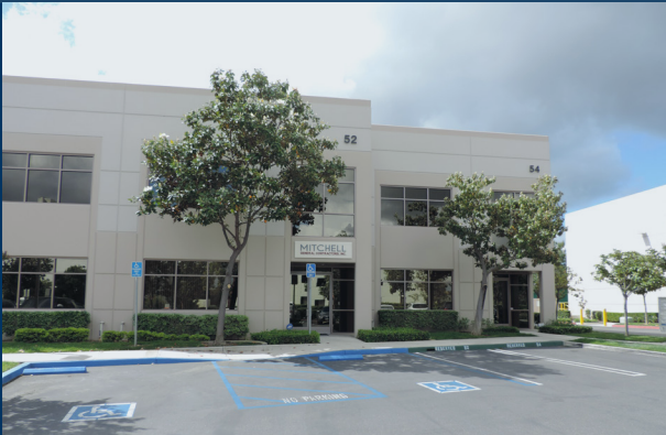
Mitchell General Contractors, Inc. Team