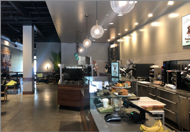
Peets Coffee - Mission Viejo

Mitchell General Contractors, Inc. is highly proficient in contract negotiations, project estimating, design issues, document preparation, building code regulations, material procurement and site management through to Certification of Occupancy.